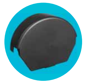
Round ridge cap