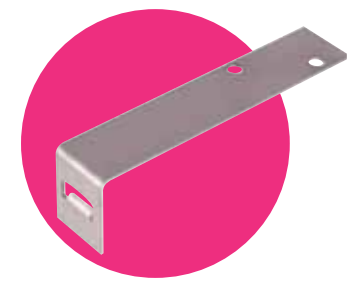
Batten end clip