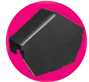
Angled ridge cap